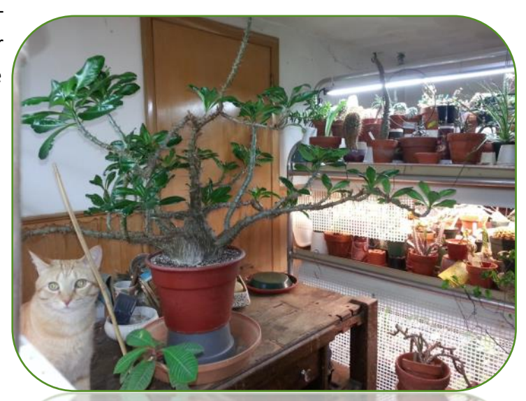
Pachypodium Saundersii (on table) and other cacti/succulents under a T5 light (top shelf) and fluorescent bulbs (two lower shelves). Notice her cat Bobo "photobombing" on the left.